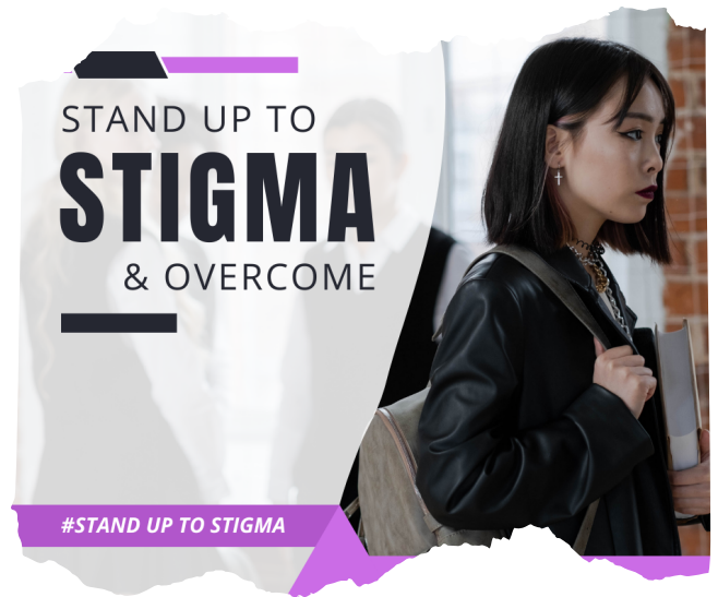
Stand up to stigma campaign flyer

The CFS Prevention Team in collaboration with North Knox School Corporation and First Baptist Church of Bicknell, came together to provide a Parent Education Night for North Knox parents. The program consistent of education provided by the evidence-based program, Triple P - Positive Parenting Program. Free dinner and child care was provided to make the event seamless for parents to attend and learn. The funding for this event was provided by the local coordinating council, Knox County Cares, and the First Baptist Church mission team. Thank you to KCC, First Baptist Church, and North Knox School Corp. for supporting this event!