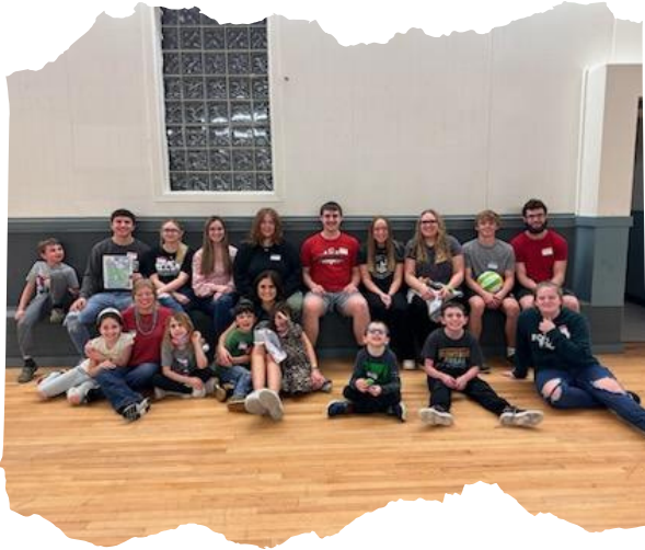
North Knox National Honor Society Students volunteering as child care workers at Parent Education night